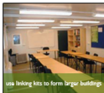
use linking kits to form larger buildings