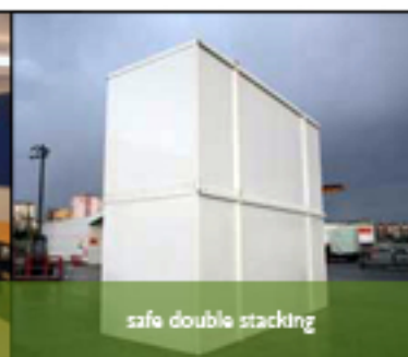
safe double stacking